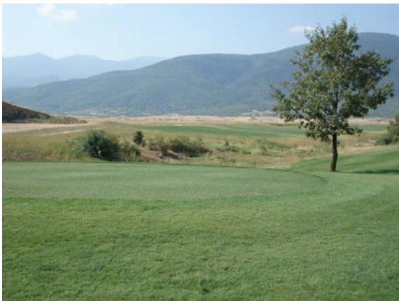
Tee Hole 2

Our Chipping and Putting greens are planned to open for use September 6 th , 2008. The 6 th is a good day on the Chinese calendar to have an opening. So please come out and give it try.