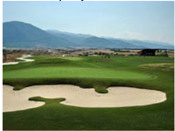
View from the Temporary Club House