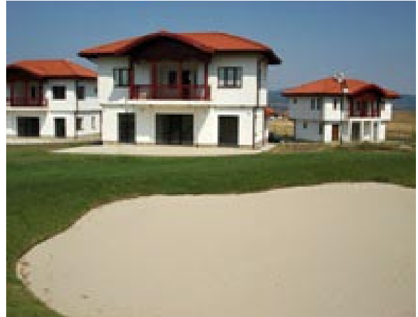
Temporary Club House