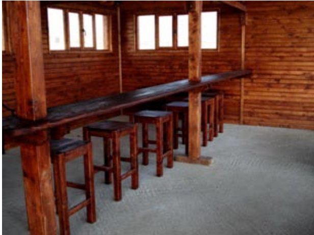
Bar at Driving Range

We are delighted to announce that we now have a bar open at the Driving Range serving cold beer and soft drinks. Our Temporary Club House will be open for use on September 6 th , 2008 serving food and beverages.